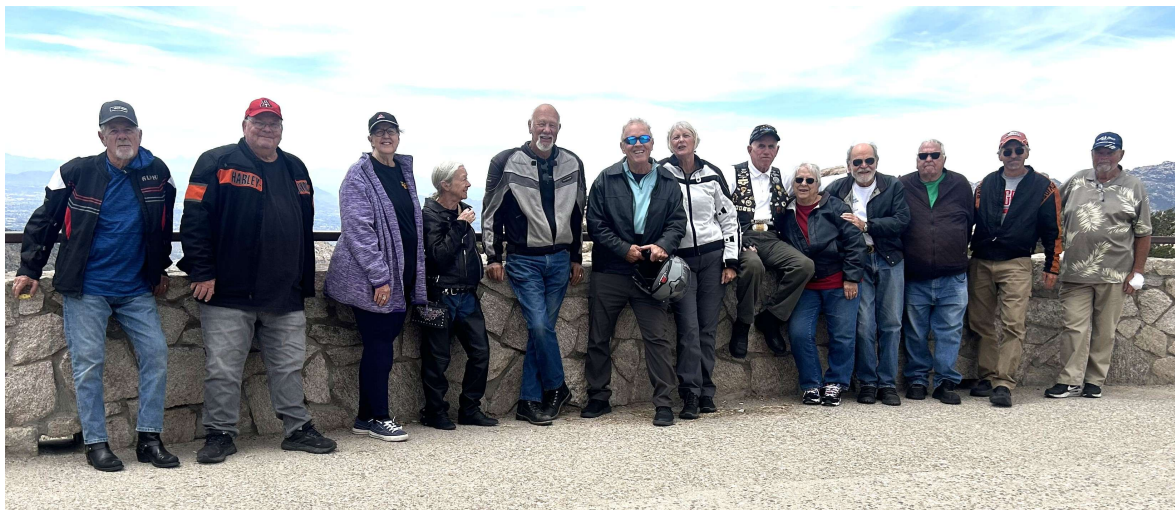
◀ Mt. Lemon