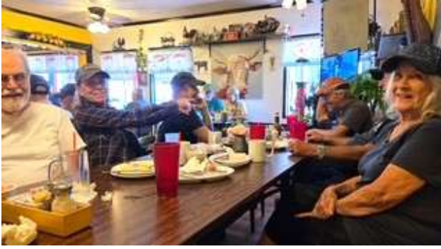
◀ Farmhouse Restaurant