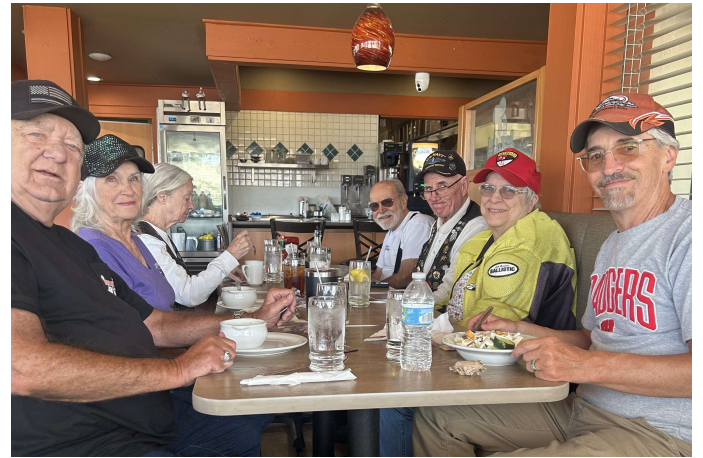
Judy's Cookhouse ▶