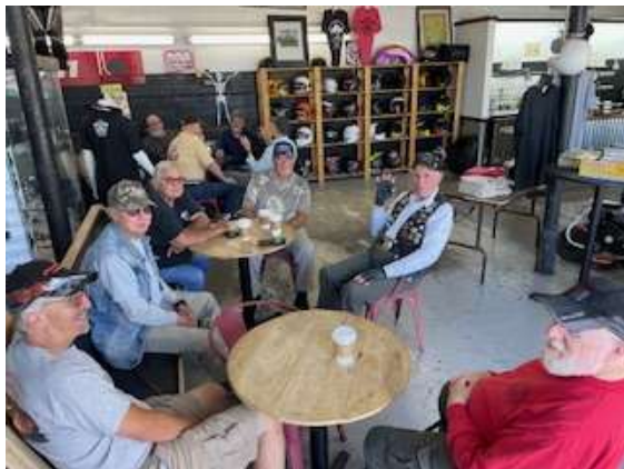
◀ Gear Shifters Gentleman's Garage