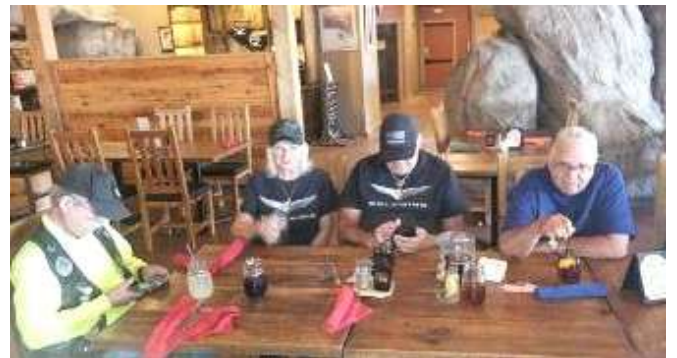
◀ Kitt Peak Picnic