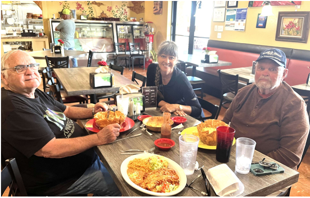
◀ Mi Tierra Mexican Restaurant