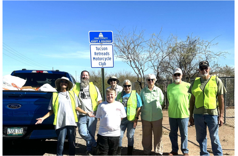
Road Clean-Up ▶